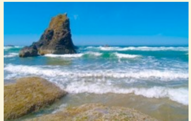
Arcadia Beach, OR