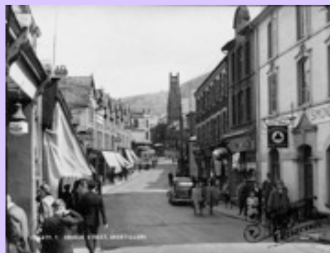
Church Street, about 1955

Abertillery has a Blues Festival in July, and its mens choir is the Cor Meibion Abertillery . There is a rugby football club, and the Ebbw Fach Trail links together 14 community Green Spaces - a total of almost 16 kilometers. www.abertillery.net