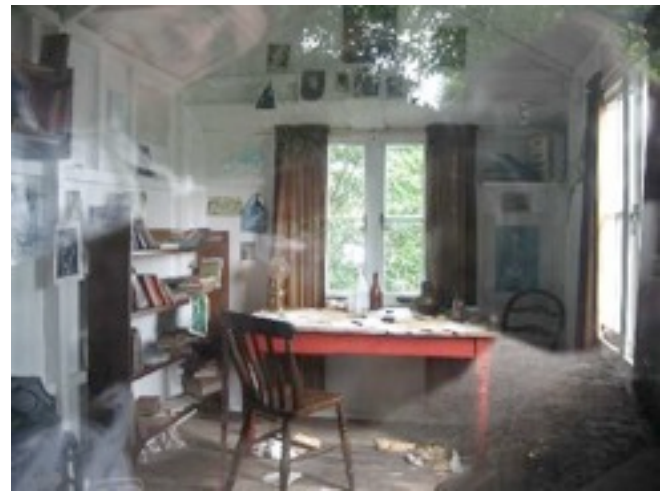
Study at Laugharne