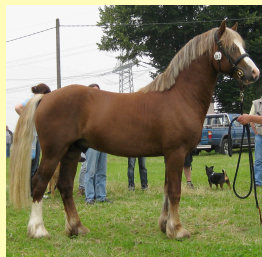
Section D Welsh Cob