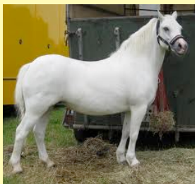
Section A Welsh mountain pony

NOTE CHANGED DATE for the SEPTEMBER MEETING Saturday, September 14th