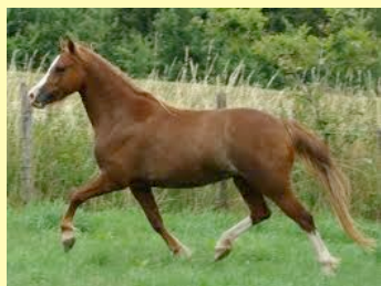
Section C Welsh pony cob type