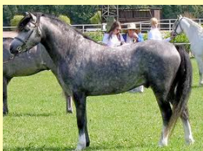
Section B Welsh pony

visit the website: http://lochinvarwelsh.com