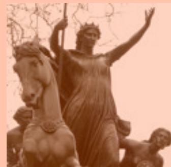
Boudicca, warrior Queen

Past women of impact, current trend setters, women leading into the days and years ahead.