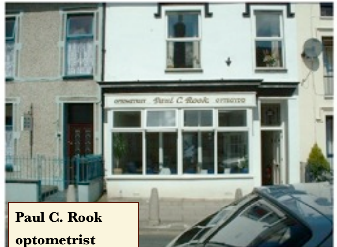
Paul C. Rook optometrist

http://javacasa.com/humor/church retrieved 10/1/11