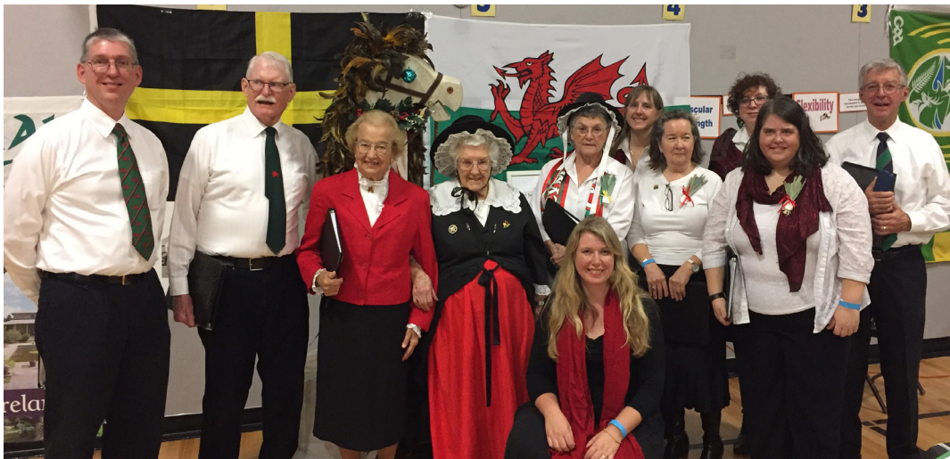
The Welsh Society Choir at the Samhain Festival

Many thanks to all those who participated and those that helped make it happen!