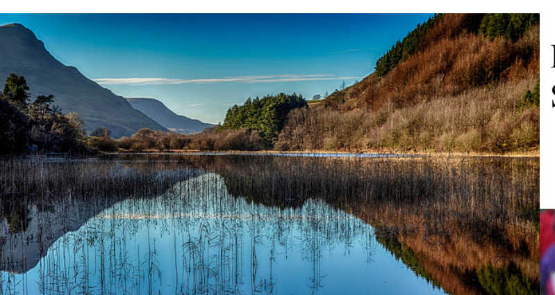
Llyn Gwernan Snowdonia

Here are a few shots to make you homesick or fuel the desire to travel to Wales!